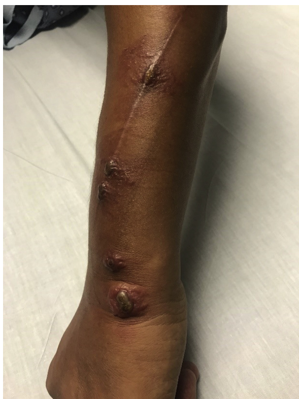
Fig 2. Sporotrichoid distribution of erythematous nodules with a central dusky center over the left arm.

prior, he noticed an initial lesion on the palmar side of his thumb followed by the appearance of a second lesion on the dorsal aspect of his thumb. They were somewhat painful to touch. The patient reported a history of contact with sheep 2 weeks before the appearance of the growths. It coincided with the Eid al-Adha celebration, and the patient acknowledged handling sheep at that time. On physical examination, a single erythematous nodule covered by