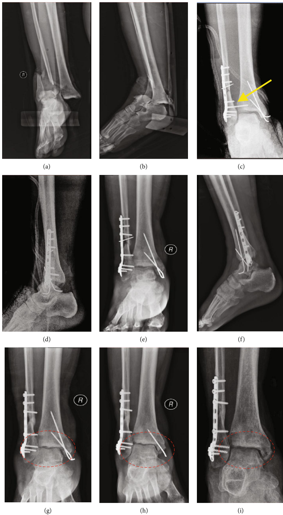
FIGURE 1: Continued.