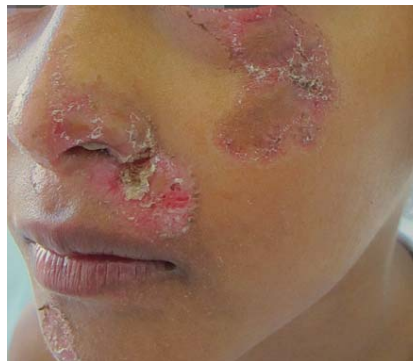
FIGURE 3: Details of the facial lesions