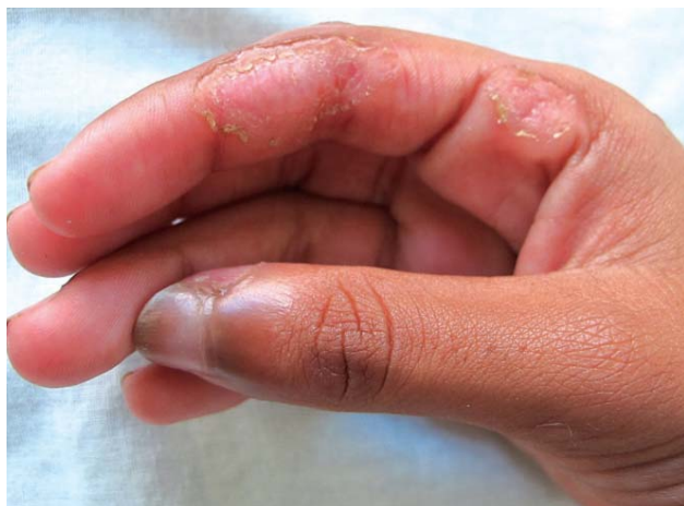
FIGURE 4: Lateral region of the second right-hand digit- erythematous plaques with elevated edges and atrophic center