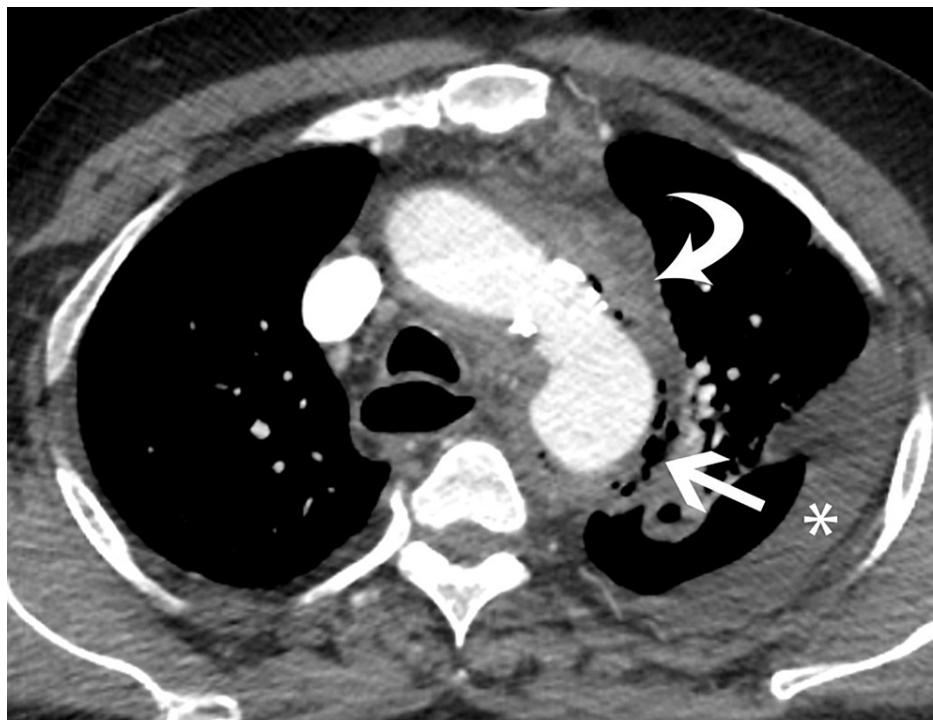
FIGURE 2: Axial image from CT scan of the chest shows fluid and inflammatory changes adjacent to the aortic arch (curved arrow), gas bubbles along the aortic wall (straight arrow) and left pleural effusion (*).