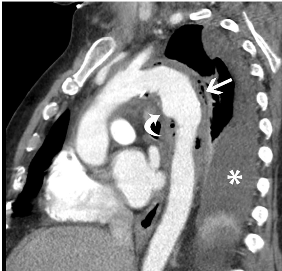
FIGURE 4: Oblique sagittal reformatted image in the plane of the aortic arch shows fluid and inflammatory changes along with gas bubbles (straight white arrow) along the aortic wall and aneurysm (curved white arrow) projecting anteriorly from the proximal descending thoracic aorta. Note left pleural effusion (*).

Blood cultures revealed Clostridium subterminale bacteremia. The patient was worked up to determine the primary source of bacterial infection. Since Clostridial infection can be associated with pathology in the gastrointestinal tract, the patient underwent colonoscopy and esophagogastroduodenoscopy, which were both negative. Abdominal CT also showed no evidence of gastrointestinal lesion or malignancy. Echocardiography, performed to exclude seeding from endocarditis, was also negative. The patient urgently underwent ascending aorta and distal arch reconstruction with a left carotid-subclavian bypass. Unfortunately, despite multiple revisions of the aortic graft, broad-spectrum antibiotics, and vasopressor support, the patient succumbed to cardiac arrest from multi-organ failure due to septic shock. Post-mortem aortic tissue cultures were positive for C. innocuum .