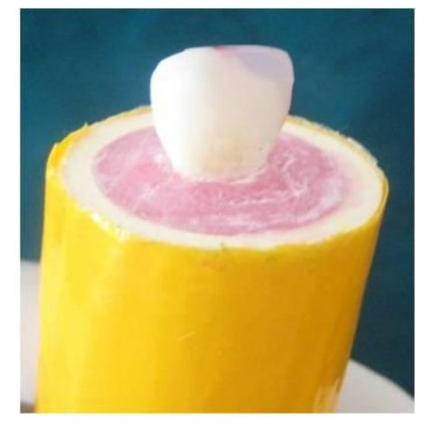
Figure 2: Completed restoration

Adper Single bond 2 Adhesive (3M ESPE, USA), a total-etch adhesive was applied on the prepared surface using adhesive applicator according to manufacturer's instruction and light-cured for 10 s using a quartz-tungsten-halogen light-curing unit (Optilux 501, Demetron; Danbury, CT, USA) with an irradiance of 500 mW/cm<sup>2</sup>. All the preparations were restored with nano filled composite using custom strip crowns in \Box bulk pack \Box technique (Figure 2).