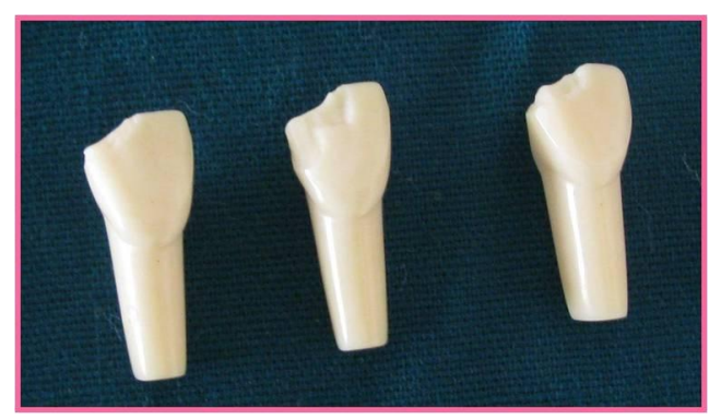
Figure 1: Different enamel preparation designs (Bevel, Stairstep Chamfer, Chamfer) on a typodont

Experimental fractures were made using lowspeed diamond disc (JUNWEI, China) at a constant speed of 150 RPM. Using a standard diamond rotary bur (Mani Inc. Diamond bur TC-S21, ISO NO. 160/014), a 45° bevel extending 2 mm beyond the fractured incisal edge and through the entire enamel thickness, was given on the cavosurface margin of the tooth. Similarly with a standard diamond rotary bur (Mani Inc. Diamond bur SO-20, ISO NO. 288/012), a chamfer preparation and stair-step chamfer preparation was placed on the labial surface of teeth in their respective groups (Figure 1).