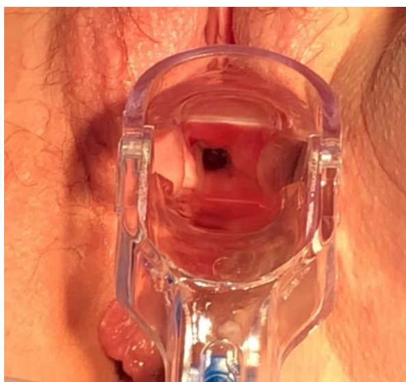
Figure 1. Vaginal orifice of the fistula.

In July 2019, due to continuous urine leakage from the vagina, the patient was examined for the vaginal location of cancer recurrence. Speculum examination revealed a vesicovaginal fistula orifice in the vaginal rag on the right side (Figure 1). Computed tomography scan, cystoscopy and cystography were then performed, and no indication for additional histopathological examination was found, but the vesicovaginal fistula was confirmed.