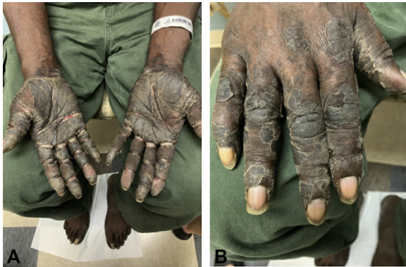
Fig 1. Hyperkeratosis and hyperpigmentation of the bilateral palms ( A ) and the dorsal surface ( B ) of a patient with HIV undergoing retroviral therapy.

boxes, and he did not undergo a patch test because he had not experienced any recent changes in terms of occupation or exposure.