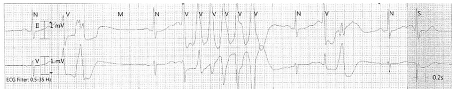
FIGURE 2: Telemetry of nonsustained VT.

On arrival at the emergency room, he had multiple episodes of non-sustained ventricular tachycardia (VT) (Figure 2).