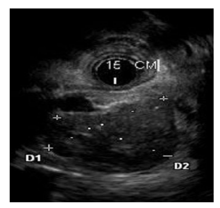
Figure 2. EUS showing the tailgut cyst.

Differential diagnosis includes epidermoid cyst, dermoid cyst, rectal duplication cyst, neuroenteric cysts, and teratomas.<sup>1</sup> Distinguishing features of tailgut cysts are precocygeal location, unlike teratomas, which are post coccygeal. Tailgut cysts are multilocular while others are unilocular. Epidermal cysts are lined by squamous epithelium only,