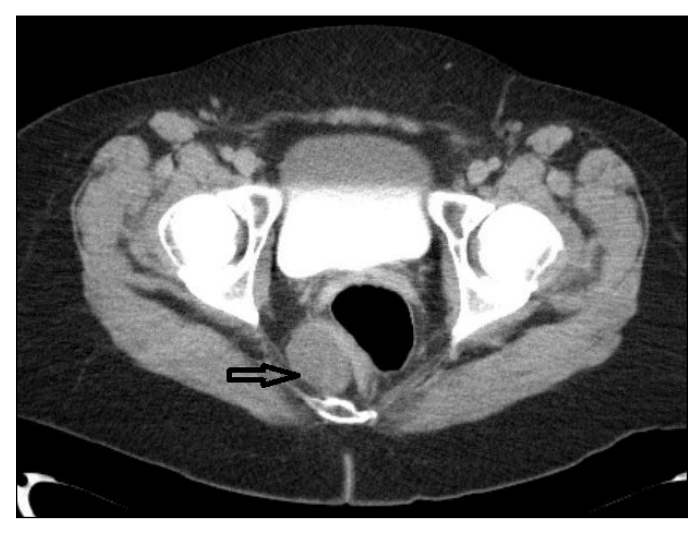
Figure 1. Axial abdominal CT showing the tailgut cyst.

Tailgut cysts occur predominantly in middle-aged women and have a female-to-male ratio of approximately 3:1. No familial association has been detected.<sup>2</sup> Tailgut cysts are usually found incidentally during physical exam. Symptoms of mass effect or pain are present in 50% of patients, and include rectal fullness, bleeding and pain on defecation, constipation, lower abdominal and back pain, and symptoms associated with genitourinary obstruction.<sup>3</sup>