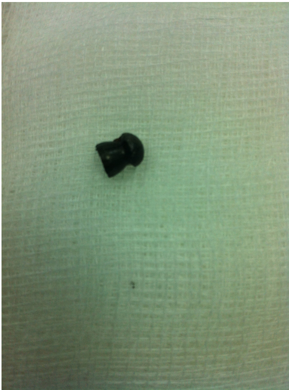
Fig. 4. The extracted air gun pellet.

including location and lack of redundancy, which prevents the formation of closed loops. The management of gunshot injuries to the abdomen has remained unchanged for many decades, with mandatory laparotomy being the standard practice. However, this practice has been challenged and some centers with extensive experience with penetrating injuries employ selective nonoperative management. Approximately 30% of abdominal gunshot wounds to the anterior abdomen and about 67% of gunshot wounds to the back can safely be managed nonoperatively. 21 Como 7 concluded that a routine laparotomy after an abdominal gun wound is indicate in cases with hemodynamic instability, peritonitis, or evisceration.