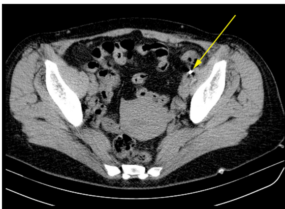
Fig. 1. Computed tomography of the lower abdomen showing an air gun pellet in the left iliac region.

Computerized tomography of the abdomen described the presence of a metallic foreign body in the left iliac region. The bone structures were not affected and free liquid in the peritoneal space was not present (Fig. 1). The laboratory tests results were found to be normal. According to her report, the physical examination of her abdomen, and the computerized tomography (Fig. 1), it was thought that the her pain might have been caused by an accidental air gun pellet. No information was provided regarding the type of used gun.