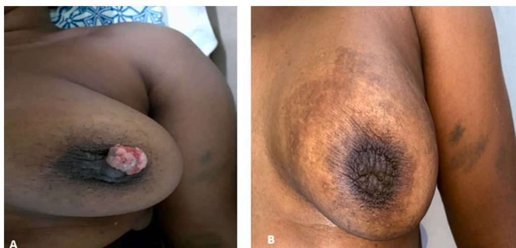
Fig. 2. Aesthetic outcome.

A: operative view; B: resection of the nipple, C: the resected specimen with macroscopic clear margins, D: reconstruction.