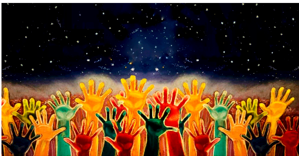
Figure 1. High-level wellness is applicable to organizations, communities, nations, and humankind as a whole. In an era of gross environmental concerns and a crisis of non-communicable diseases, personalized medicine must be increasingly viewed in the context of planetary health.

In a landmark paper in the American Journal of Public Health (1959), biostatistician and public health physician Halbert L. Dunn urged professionals to move beyond the static notion of ‘health’ and conceptualized the idea of ‘high-level wellness’ (Figure 1). He proposed that high-level wellness—as a goal and way of life—was applicable at scales of person, communities, and civilization at-large; he defined high-level wellness for the individual “as an integrated method of functioning which is oriented toward maximizing the potential of which the individual is capable, within the environment (in which they) are functioning” [3]. In simplest form, the goal of high-level wellness was life with energy, vitality and zest, and it could only be concretized as a ‘way of life’ [4].