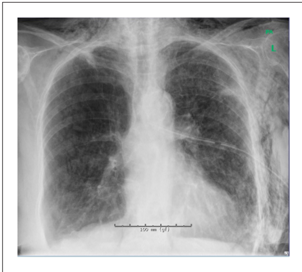
Figure 1. Chest x-ray taken prior to chest drain removal, showing no obvious signs of pneumothorax. SE can be seen, especially on the left side of the thorax and bilaterally in the nuchal area.

Previously, only a few articles have described the tardive development of SE. Tardive SE has for instance been described in relation to abdominal surgical procedures where SE arose after the termination of induced pneumoperitoneum, 9,10 up to days after the procedure. This is different to our case, as this relates to the abdominal cavity.