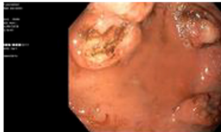
Fig. 2. Upper digestive endoscopy showed gastric metastasis, confirmed by pathologic report, 15 months after ICI treatment start.

Despite lack of identification of any circulating antibody in serum and cerebrospinal fluid, we assumed the most likely hypothesis of immune-mediated cerebellar degeneration and started treatment with methylprednisolone pulse therapy (1g/day for 5 days).