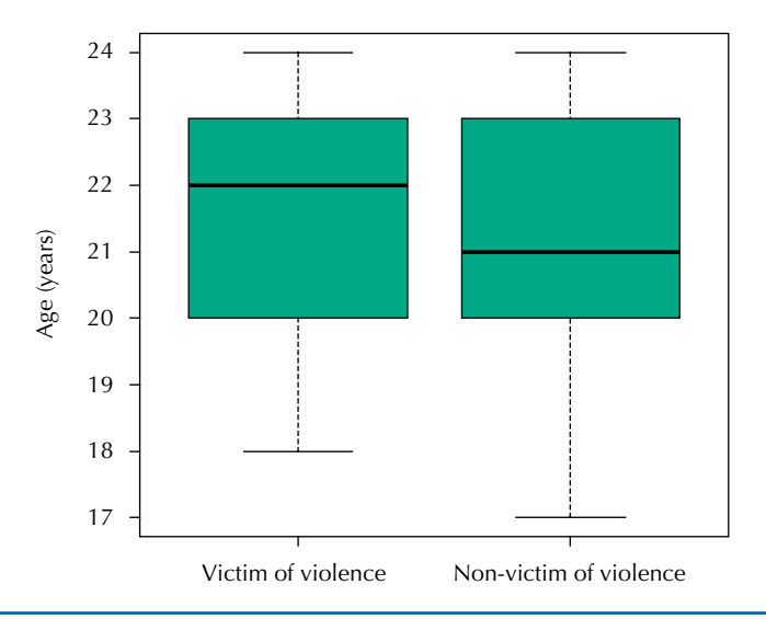
Figure 1. Boxplot of the age of victims and non-victims of sexual violence.

Regarding the occurrence of sexual violence at some point in their lives, 71 students (8.3%, with 95% confidence interval between 6.4% and 10.1%) were victims of sexual violence, 73.2% girls (n = 52) and 26.8% boys (n = 19). The victims of violence presented higher age (p = 0.014) and lower socioeconomic status (p = 0.003), i.e., there were more victims in classes B2 and C, proportionally (Figures 1 and 2).