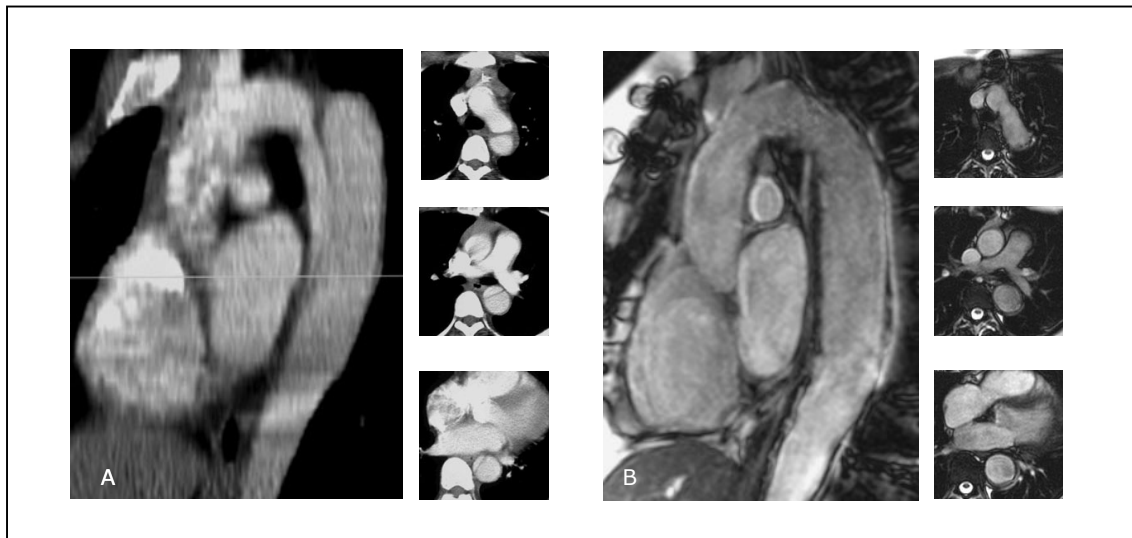
Figure 1 A. Sagittal view of a contrast enhanced computed tomography scan showing a native type B aortic dissection in a young Marfan syndrome patient; the 3 pictograms in axial view identify a small true lumen and a larger false. B. Gd-enhanced MR tomogram in sagittal orientation; Follow-up study one year after endovascular stent-graft placement showing no resident false lumen and reconstruction of the dissected aorta as confirmed on axial pictograms.

the endovascular stent-graft placement was achieved in 92%. Early complications like wound infection and postoperative myocardial infarction was seen in 25%. There were no perioperative mortalities or immediate conversion to open surgery (Baril et al 2006). Elective conversion to open surgery was performed in 3 of 6 patient in the follow-up (28 and 52 month after EVSG) due to progression of the aortic disease in the entire aorta ( n = 2 ) and due to rupture of the intercostal patch ( n = 1 ). Similar satisfactory results with asymptomatic subjects and lacking signs for a dilatation in the treated aorta were reported in other case reports (Umana et al 2002; Fleck et al 2003; Dong et al 2005; Gaxotte et al 2006). Botta and colleagues (2006) treated successfully a patient with unusual rapid evolution of type B aortic dissection following heart transplantation, which had an incidence of 40% for thoracic aortic dissection. The mortality rates of endovascular stent-grafts for patients with acute aortic syndromes range from 0% to 16% while the same patients treated surgically would have a risk in the range of 40% or perhaps even exceeding up to 70% if treated medically (Fann et al 1994).