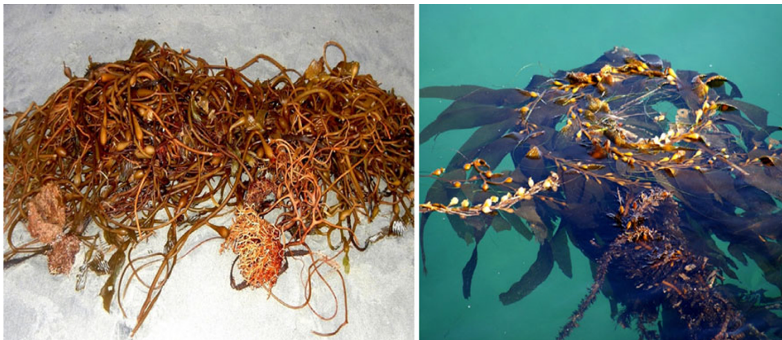
Fig. 1 Seaweeds growing on the California Coast of the Pacific Ocean