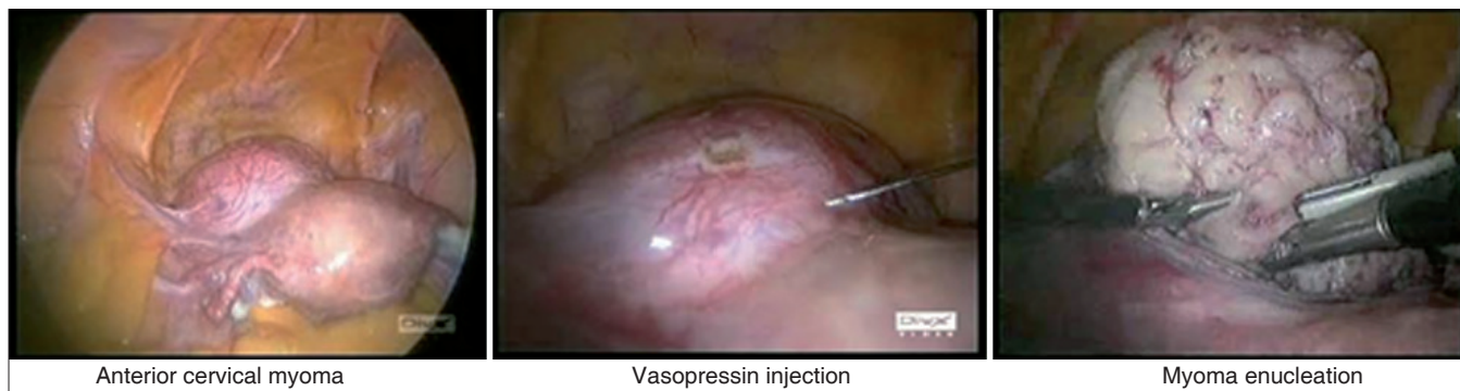
Figure 1: Posterior myomas we prefer a midline vertical incision to avoid injuring the vessels and to stay at a safe distance from the ureters

An average of 20 U/mL diluted in 200 mL of saline can be laparoscopically injected into the myoma in the presence of a posterior uterine wall myoma and in the layer between the myoma and the serosa, in an attempt to reduce operative blood loss.