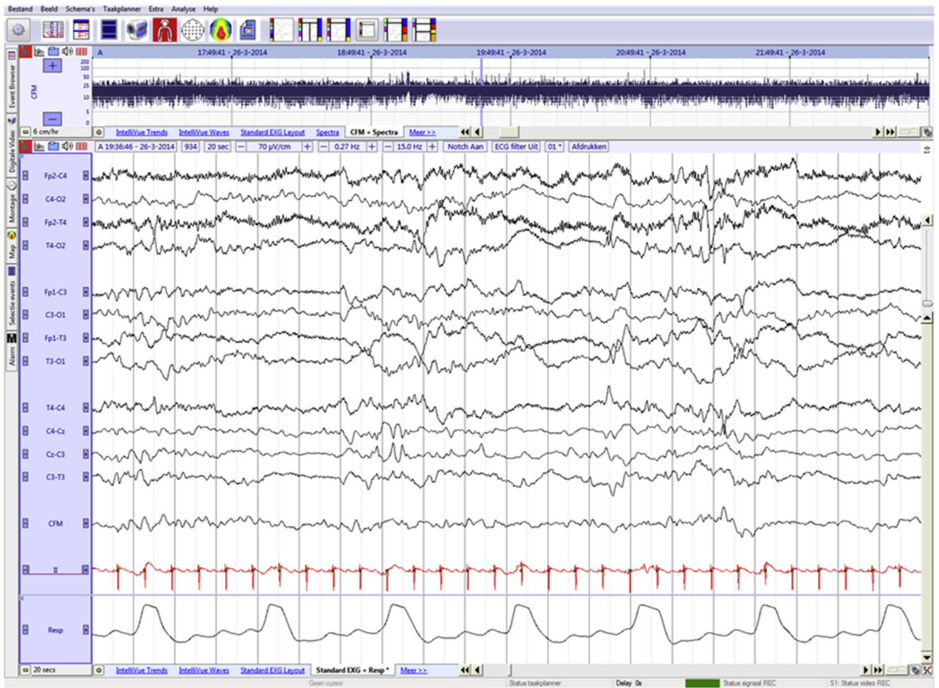
Figure 4. Male, 40 weeks GA, home birth with complicated labour. Thompson score 13. EEG at 18 h of age. Grade 1 background score based on \Delta BI amplitude >15 \mu\text{V} - 25 \mu\text{V} and duration <10\text{s} . Favorable outcome.