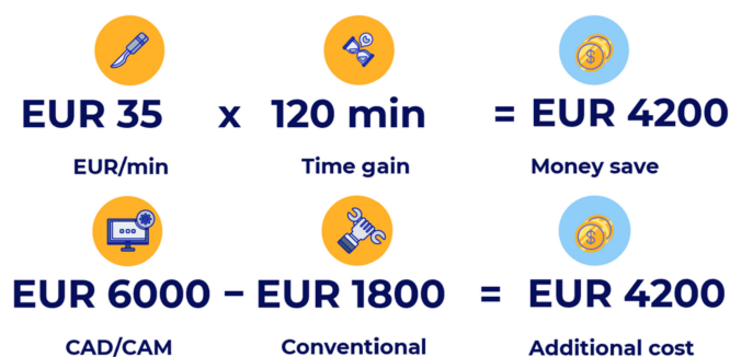
Figure 2. Cost savings. Cost comparison of pre-curved plates and virtual planning, taking into account the cost savings from the OR time gain.

Furthermore, a decrease in operative time can improve patient outcomes by reducing the risk of developing complications, since the probability of developing complications increases by 14% with every 30 min increment in operating time [6]. For CAS patients, we found 5% fewer complications.