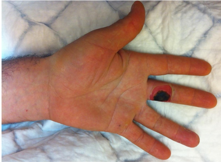
Figure 1 Initial appearance of the finger with skin necrosis corresponding to a third degree chemical burn.

the wound was closed after 58 days of controlled scarring (Figure 3). We decided against skin grafting to improve the aesthetic result and the wound appeared not deep enough to consider a local flap. Complete extension of the PIP joint recovered with use of a 3-point digital splint. Sensibility remained impaired at a 6 month follow-up, with neuropathic pain (tingling, stiffness, numbness) according to the pain questionnaire of Saint-Antoine (French equivalent of the McGill pain questionnaire from Melzack) (Melzack 1975). The assessment of axonal injury was positive: Pressure threshold 1.5 g, 2 point