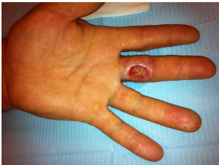
Figure 2 Appearance of the finger after full thickness skin debridement.

Warts are caused by some species of human papillomavirus (HPV) and affect adults and children (Lebwohl et al. 2010). They are contagious and usually enter the