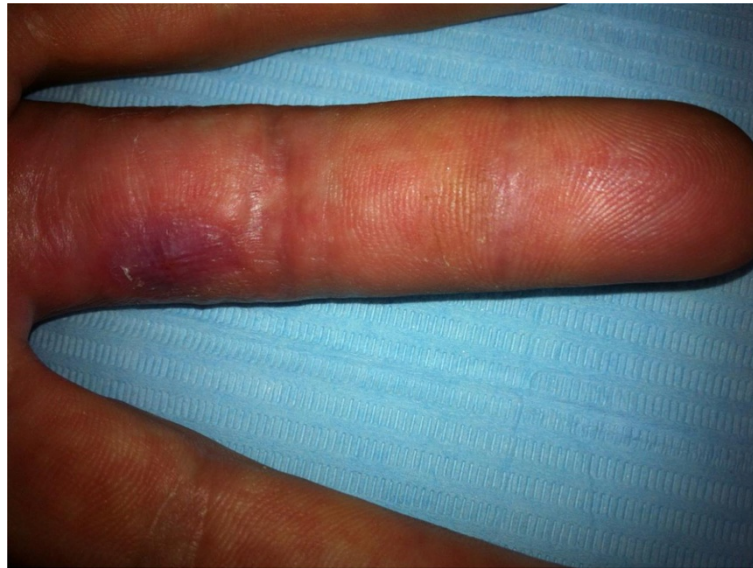
Figure 3 Appearance of the finger after complete healing.

body through an area of broken skin. They typically occur on the hands and feet, but can appear on any part of the body including face, nails and genitals. Warts often disappear spontaneously after a few months but may last for years and can recur (Micali et al. 2004).