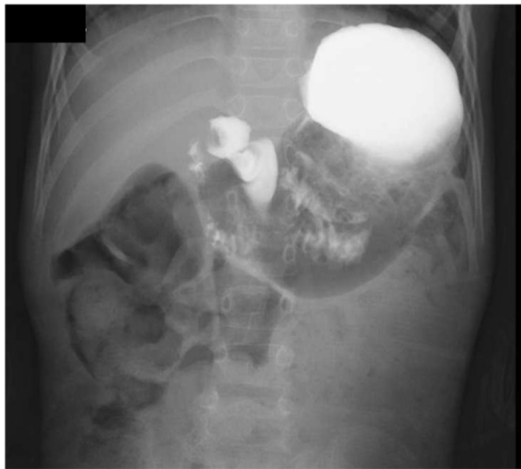
Fig. 3 UGI series showed smooth passage of contrast through the pylorus

possible full-thickness disruption of the pylorus [6]. Ogawa et al. reported a case of successful EPBD for HPS [7].