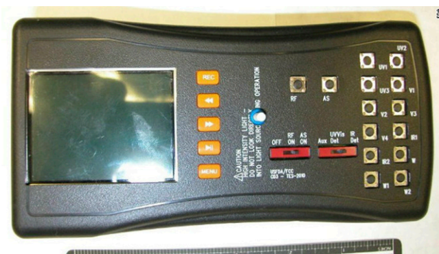
FIGURE 1. The CD-3 current generation of the instrument.

The CD-3 is a compact (15.2 × 7.6 cm; 300 g) handheld electronic tool (Figure 1) with multiple single wavelength light-emitting diode (LED) light sources that cover the spectral region from the ultraviolet (UV) to the infrared (IR). 29 The CD-3 features two charged couple device (CCD) cameras that provide the user with the ability to view samples in real time and capture images and videos of the suspect samples being screened. One camera operates in the UV-visible (UV-Vis) spectral region, and the second camera operates in the