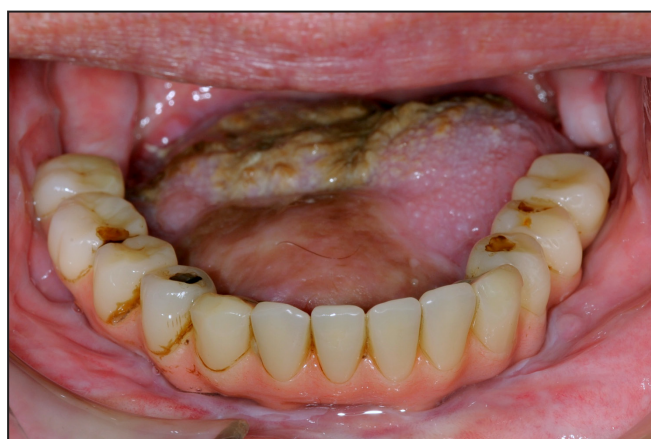
Figure 1B. Photograph of patient number III after dental rehabilitation was fulfilled.

Two patients denied any further treatment or surgery. If dental implants were planned and performed, soft tissue reduction was needed in 5 of the 6 patients.