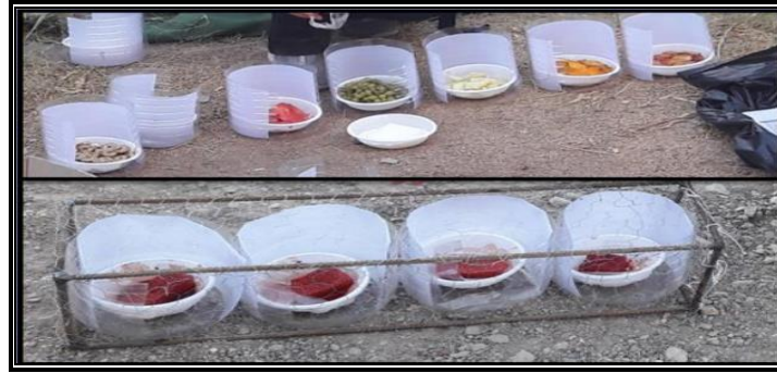
Fig. 2. Baiting traps for attracting sand flies