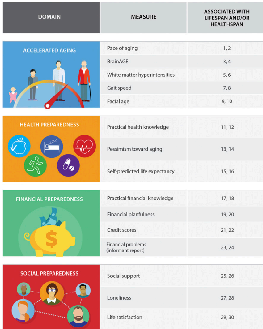
Fig. 1. Aging domains and measures assessed in the current study. Column three indicates reference numbers for prior studies documenting associations between the given measure and life span and/or health span. The complete reference list is included in SI Appendix, Table S1 .

Children's self-control is correlated with their socioeconomic circumstances (25, 26) and their intelligence (27, 28). Both social class and intelligence have been implicated in life span and health span (29, 30); in fact, both social class and intelligence have been called "fundamental causes" of later-life health (31–33). Social class has been proposed as a fundamental cause because it influences multiple disease outcomes through multiple mechanisms, it embodies access to important resources, and its associations with health outcomes are maintained even when intervening mechanisms change (31). Intelligence has been conceptualized as a fundamental cause for similar reasons (32).