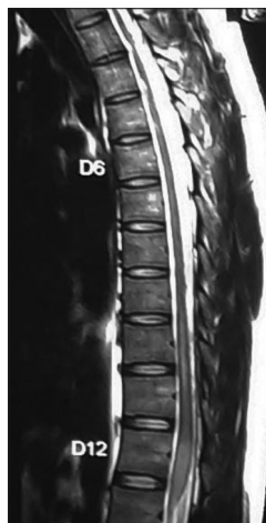
Figure 1: Magnetic resonance imaging of dorsal spine showing central T2 hyperintensities of the cord

Pang and Pollack have classified SCIWORA into four groups on the basis of age. [11] The adult group (16–45 years old) under which the patient in this case falls, is known to have a low incidence rate of SCIWORA while it is commonly seen in the pediatric population. The higher incidence of SCIWORA in children has been attributed to the inherent soft tissue elasticity of spine in children. [12] There is a decrease in elasticity of the spine as the child grows leading to higher incidence of bony fractures in adults. Another hypothesis states that SCIWORA is caused by the differential stretch of the spinal cord and the spine. Besides these, there are vascular and concussive hypotheses, but they lack accurate evidence. [12] While most of the SCIWORA cases are accounted for by cervical