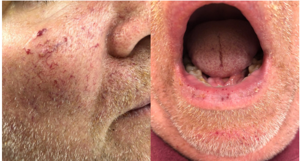
FIGURE 1: Mucocutaneous telangiectasias

A 60-year-old male with a history of recurrent epistaxis since childhood presented with four weeks of intermittent fevers, fatigue, new-onset word-finding difficulties, slurred speech, headaches, blurred vision, and nausea. Upon presentation, he was febrile and tachycardic. Physical exam was notable for delayed speech, impaired concentration, multiple mucocutaneous telangiectasias (Figure 1), and left-sided weakness. Further investigation revealed a history of recurrent gastrointestinal bleeding in his mother and a sister with recurrent epistaxis since childhood. Labs were significant for leukocytosis (white blood cell count [WBC] 16 \times 10^3/\mu\text{L} ) with a neutrophilic predominance.