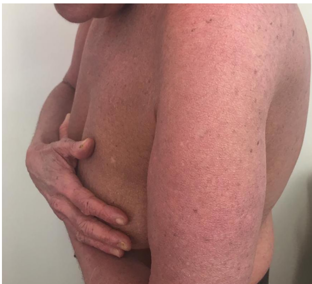
FIGURE 1 Patient with erythroderma at diagnosis of Sézary syndrome

A pandemic coronavirus, severe acute respiratory syndrome coronavirus 2 (SARS-CoV-2), causes a disease called coronavirus disease 2019 (COVID-19), which is potentially life-threatening. Patients with hematologic malignancies may be at an increased risk of severe COVID-19 due to immunosuppression related to the underlying disease and/or its treatment. 1 Sézary syndrome (SS) is a rare leukemic type of primary cutaneous lymphoma, defined by the triad of erythroderma, lymphadenopathy, and clonal T cells in the skin, lymph nodes, and peripheral blood. 2 Skin infections frequently occur at sites of breakdown caused by the disease, and may result in death. 3 In addition, chemotherapy and corticosteroids further increase the susceptibility to infection. 4,5 The outcome of COVID-19 in these patients is unknown. Herein, we present two cases of patients with SS who developed COVID-19.