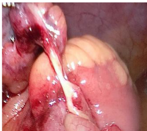
Fig. 3. laparoscopic view showing a band 20 cm from ileocecal valve originating from a small bowel diverticulum.

Laparoscopic exploration showed dilated small bowel loops with collapsed distal ileum and an inflammatory band was found 20 cm from ileocecal junction originating from a small bowel diverticulum with no palpable intraluminal masses (Fig. 3). The inflammatory band was present at the distal part of the diverticulum and was adhered to a small bowel segment leading to obstruction. The band was released, and wedge resection of the diverticulum was performed at its base by gastrointestinal anastomosis (GIA) on healthy tissue, about 2 cm from the inflamed segment, which is a standard surgical approach for MD. The postoperative period was uneventful. The patient was initially kept at regular surgical floor bed and then discharged on the second postoperative day, when he passed good bowel motion. The histopathology result on follow up visit showed MD with Schistosoma infection, most likely by Schistosoma mansoni . The patient was referred afterwards to the infectious disease department for initiation of praziquantel, which is the drug of choice for schistosomiasis and is effective against all Schistosoma species. This is an extremely rare case of acute SBO. It demonstrates the importance of diagnostic laparoscopy in all patients with virgin abdomen who present with acute bowel obstruction.