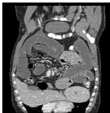
Fig. 2. CT abdomen showing Small bowel complete obstruction with transitional zone seen distal ilealloops.

MD originates from incomplete obliteration of the vitelline duct, which occurs around the fifth week of gestation. The complications of MD are greatest in the first two years of life. Haemorrhage, secondary to peptic ulceration, is the most frequent manifestation. Next, is the frequency of intestinal obstruction and intussusception being the leading cause. Intestinal obstruction accounts for