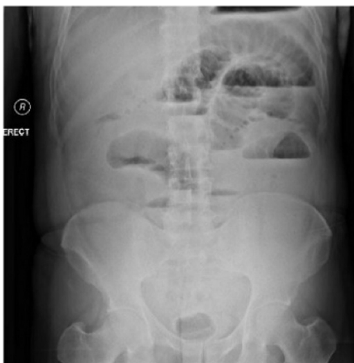
Fig. 1. abdomen x ray, showed multiple air fluid level.

inflammation, and perforation [3]. Intestinal parasitosis refers to a group of diseases caused by one or more species of protozoa, cestodes, trematodes, and nematodes. Intestinal parasitic infections (IPIs) caused by pathogenic helminths and protozoan species are endemic throughout the world [4]. The intestine is frequently involved during Schistosoma infection, especially with Schistosoma mansoni . We report a rare presentation of acute SBO with an inflammatory band around MD. The work has been reported in line with the Consensus Surgical CAse REport (SCARE) criteria [5].