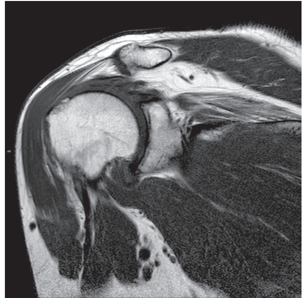
Figure 2. MRI at 3 months follow up

Our results are in line with Senekovic et al (9) that reported an increase of Total Constant Score from 33.4 to 65.4 points on 20 patients treated with InSpace Balloon ® , with an evident improvement of power at 18 months ( p < 0.003 ) and of function at 3 years. Similar outcomes were obtained by Naggar et al (11). In a mean follow-up of 24 months good and excellent