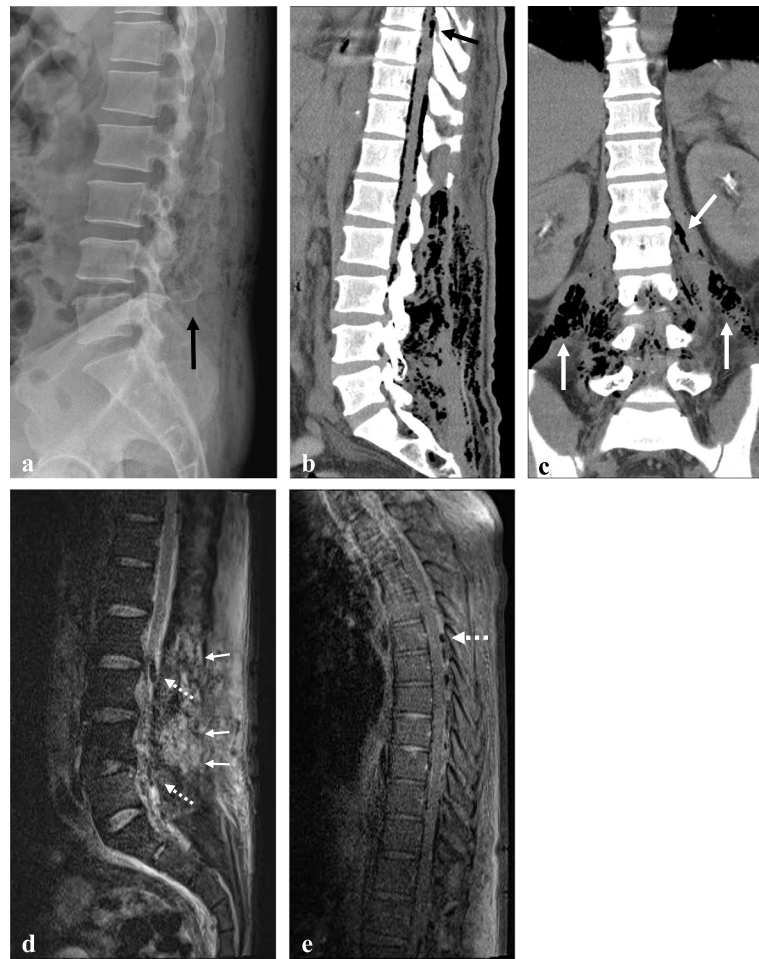
Fig. 2 Lateral radiographs (a) showing an aggressive gas-forming lesion around the lumbar paravertebral area (black arrow). Sagittal and coronal computed tomography (b and c) scans showing aggravating subcutaneous emphysema in the psoas muscle (white arrows) and paravertebral muscle as well as in the lumbar epidural space. Sagittal magnetic resonance imaging (d) showing aggressive dissemination of multifocal fluid pockets containing innumerable air bubbles in the paraspinal area, whole lumbar area (white arrows), and epidural space (white dotted arrows), which disseminated into the T5 level (white arrow) (e)