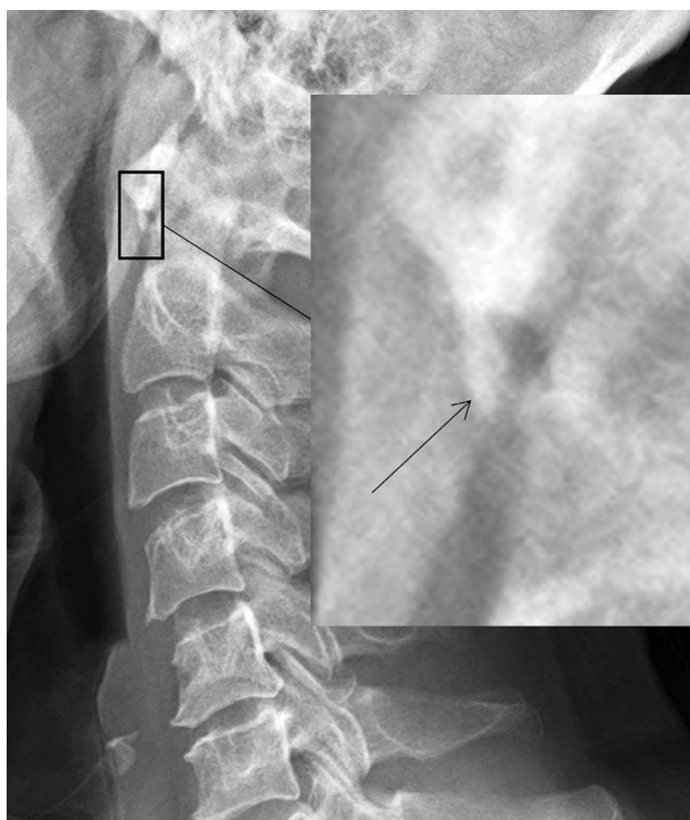
Figure 3. Lateral cervical X-ray showing soft tissue calcification caudal to anterior arc of atlas (arrow). Regression can also be noticed in prevertebral soft tissue thickening.

of the calcification adjacent to the atlas anterior arch was not as obvious as in CT, it could be seen (Figure 3).