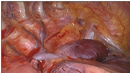
FIGURE 2: Thoracoscopic surgery revealed a mass arising from the azygos venous arch; there was light adhesion.