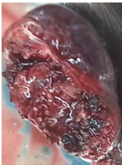
FIGURE 4: A complete resection of 4.2 cm mass of the azygos venous arch was performed and some thrombosis within the mass was observed.

As hemangioma of the azygos venous arch is very rare, differential diagnosis would include pericardial cyst, tracheal cyst, Castleman's disease, and neurogenic tumor if the tumor presents adjacent to the trachea and posterior mediastinal mass [6].