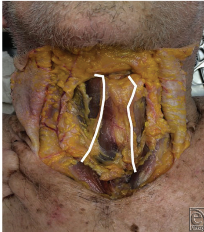
Figure 1. A cadaveric specimen demonstrating the location and course of the anterior jugular veins in the anterior neck.