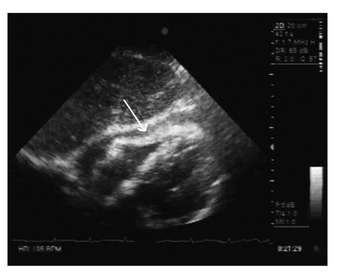
Figure 1. Subcostal 4-chamber view echocardiography revealing mixed effusion and hematoma around the right atrium and right ventricle responsible for the right ventricular collapse (arrow)

Emergent bedside TTE revealed severe LV systolic dysfunction (LVEF = 25%) and akinesia of the base and mid inferior, base and mid septal, and mid posterior segments as well as large pericardial effusion associated with diastolic