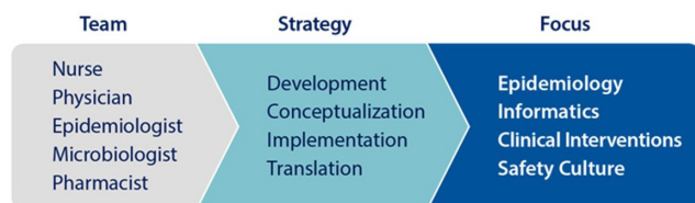
Figure 2 Structure, strategy and focus of interdisciplinary patient safety teams. Our programmes emphasise the value of team structure which comprised staff from different roles. The strategies of team-directed safety programmes can address safety challenges using tools of different fields. Collectively, teams can take on safety projects that are ambitious yet focused, bringing complementary knowledge and approaches. The focus of our programmes emphasises evidence-based patient safety challenges in global health.

improve patient safety. We emphasised the value of viewing medical errors as learning tools rather than for punitive action.