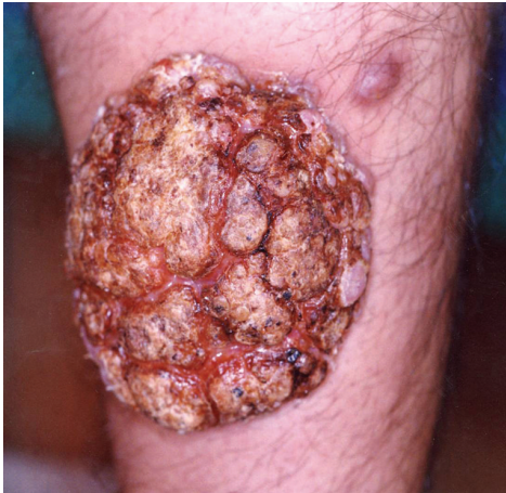
FIGURE 2: Tumoral lesion on the right shin.

Leishman bodies were seen in histiocytes, especially in the specimen obtained from the lower leg lesion (Figure 3). With regard to the clinical and histopathological findings, the diagnosis of reactivation of CL was made.