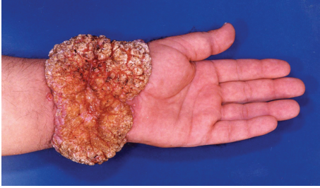
FIGURE 1: Tumoral and cauliflower-like lesion on the left wrist.