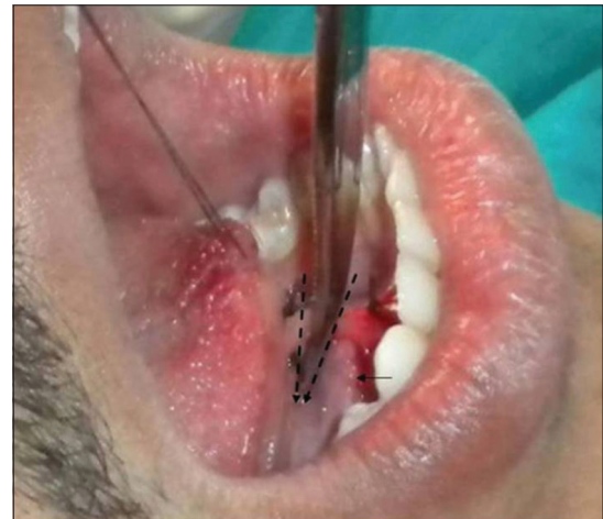
Figure 4: Line of incisions (dotted lines) (Case 2)