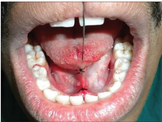
Figure 3: Two vertical rows of suture parallel to each other (Case 2)