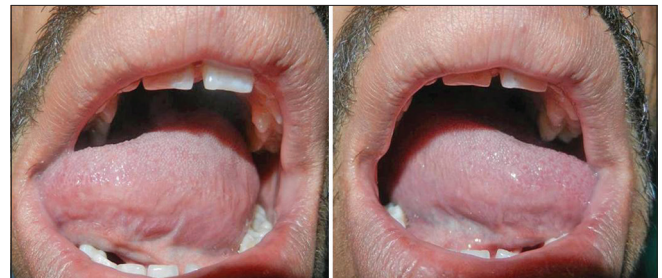
Figure 10: Tongue position on left and right lateral movement after 2 years (Case 2)