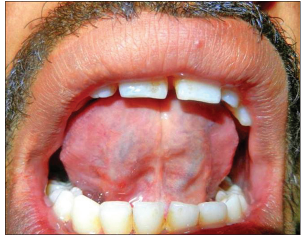
Figure 8: Follow-up after 2 years (Case 2)