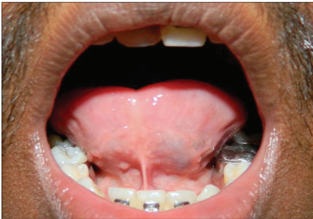
Figure 1: Preoperative view – Class II ankyloglossia (Case 1)