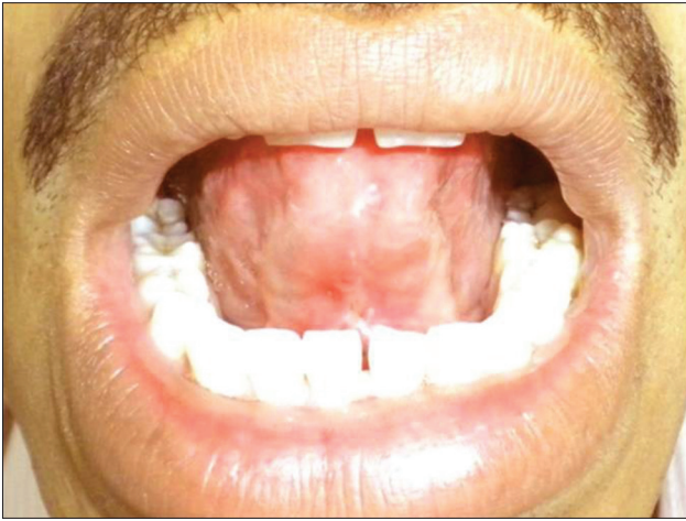
Figure 7: Postoperative 1-week view (Case 2)