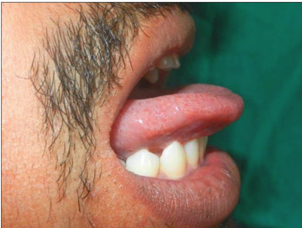
Figure 9: Tongue position after protrusion after 2 years (Case 2)