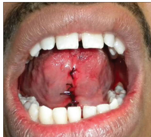
Figure 6: Immediate postoperative view (Case 2)

and avoidance of any hot, hard or spicy food stuff. The postoperatively tongue exercise included touching of tongue to the palatine rugae while keeping mouth opened, rolling tongue side to side touching corner of the mouth,