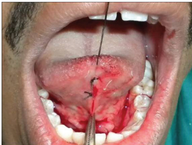
Figure 5: Presuturing prevents excessive opening of diamond shape wound (Case 2)