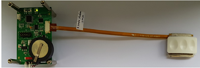
A. Cricoid force system comprising of (i) sensor comprising of capacitance sensor below and a teflon contact above (ii) visual display indicator.