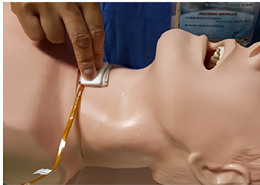
B. Sensor placed over manikin