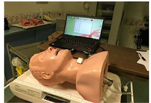
C. Manikin within weighing scale