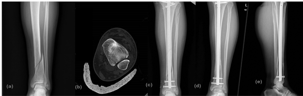
Fig. 1. A 30-year-old male AO-OTA 43 C1 (a) preoperative X-ray, (b) preoperative computed tomography, (c) early postoperative X-ray, (d, e) postoperative X-ray at 19th month.