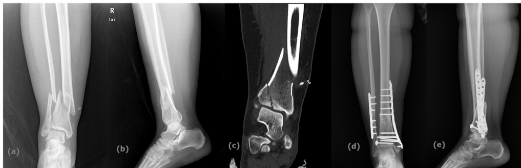
Fig. 2. A 40-year-old female AO-OTA 43 C2 (a) preoperative X-ray, (b) preoperative computed tomography, (c) early postoperative X-ray, (d, e) postoperative X-ray at 28th month.