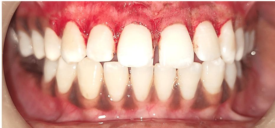
FIGURE 6: Figure depicting sites treated by scalpel and laser

Figure 6 shows treated areas by scalpel and laser.