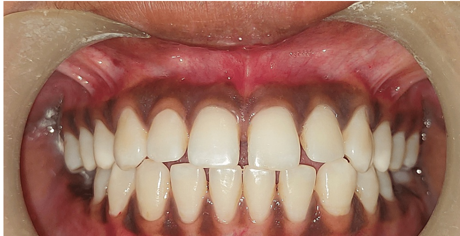
FIGURE 1: Baseline view

Periodontology at the Sharad Pawar Dental College, Sawangi Meghe, Wardha. It had been present from childhood, which suggested physiological melanin pigmentation. Clinical examination indicated considerable gingival melanin pigmentation in the upper and lower jaws. The patient was a non-smoker with a wheatish complexion. There was no family history of gingival pigmentation. The patient was in good health overall and had good oral hygiene. The patient was aware of the numerous treatment choices and the possibility of re-pigmentation after a specific period. Phase I treatment was performed on the first appointment. A split-mouth approach was planned, contrasting scalpel and laser techniques. Figure 1 shows the baseline view of hyperpigmented areas.