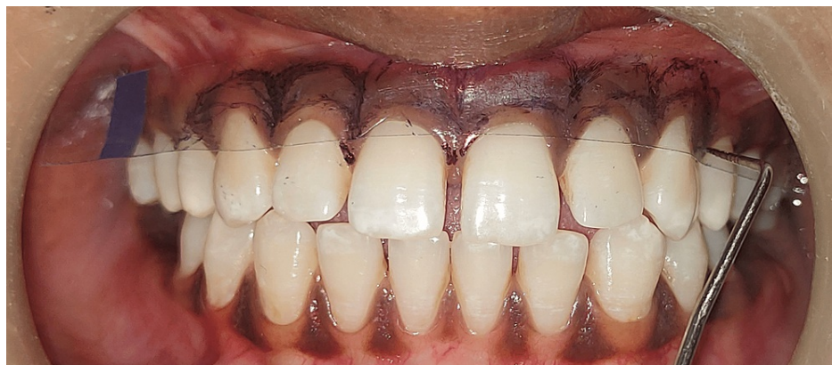
FIGURE 2: Figure depicting the hyperpigmented area

Lignocaine infusion with adrenaline was used locally as a method of infiltration. Figure 2 depicts the extensions of the hyperpigmented site.