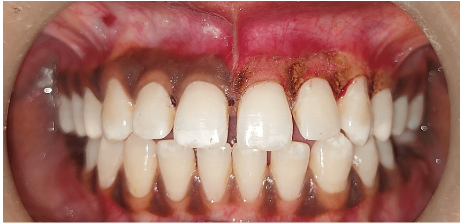
FIGURE 5: Figure depicting treated site using laser

The image shows the left anterior upper quadrant treated using a laser