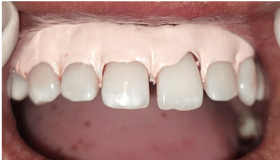
FIGURE 8: Periodontal pack applied

A periodontal pack was applied, as shown in Figure 8.