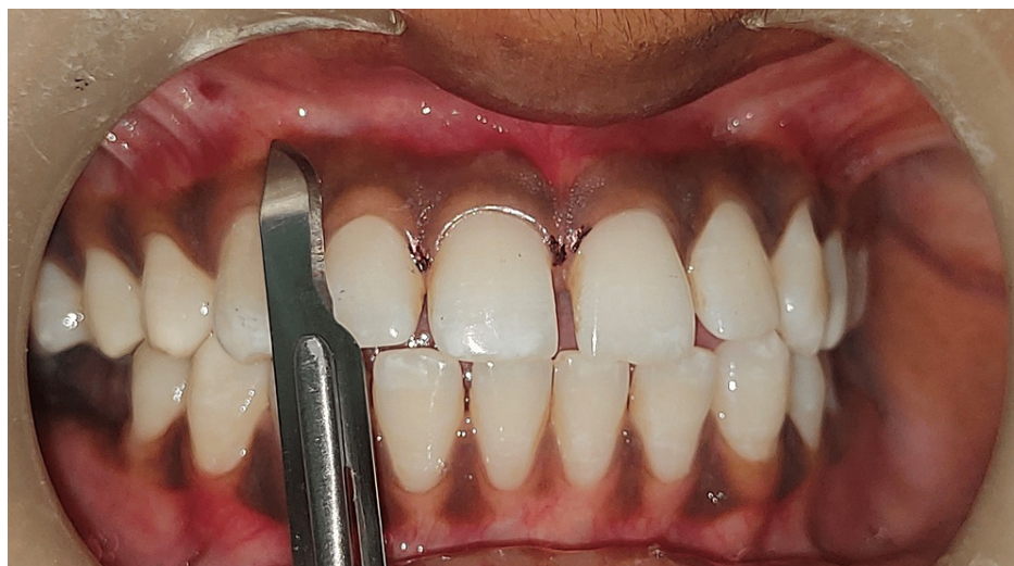
FIGURE 4: Depigmentation using scalpel

The conventional/traditional method was performed for depigmentation of the maxillary right anterior area from the central incisor to the canine (anterior aesthetic section), using a #15 blade as shown in Figure 4.