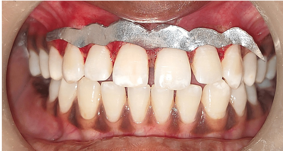
FIGURE 7: Figure depicting the stent in place

The image shows treated sites assessed using a tin foil stent covering the denuded surface