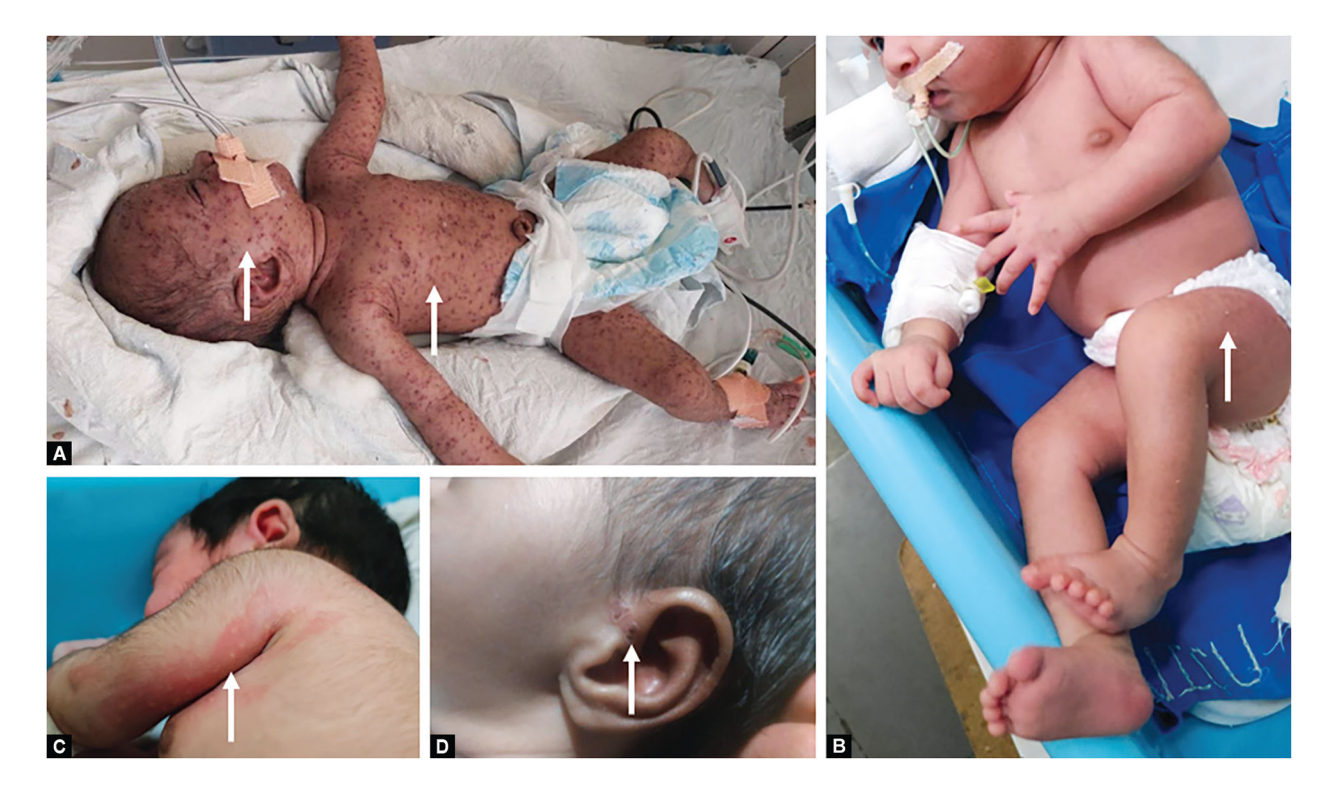
Figs 2A to D: Erythematous vesicular lesions in neonatal varicella (arrows). (A) Severe CVS with extensive skin lesions and multisystem disease. Lung involvement necessitated respiratory support; (B) Perinatal CVS. The infant had feeding difficulties; (C) and (D) Postnatal varicella with mild, limited cutaneous lesions