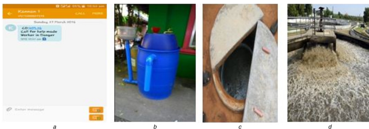
Fig. 4 Various sources of hazardous gases and alert system a Alert message from the proposed system b Biodigester c Septic tank of an organisation d Waste water treatment plant

3.2. Test conducted in septic tank of an organisation: In an educational institution, human urinal wastes were collected and then the purification process was carried out. Testing was done at the septic tank opening and at the places of various stages of the purification process. We analysed that the concentration of the methane and carbon monoxide differ from one place to another.