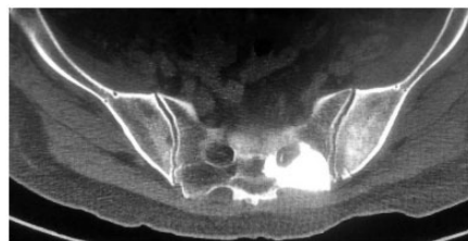
Figure 8. Computed tomography showed the incorrect location of the osteoplasty.

with her symptom (Figure 6). After readmission, we performed percutaneous osteoplasty under C-arm X-ray guidance. During the operation, the lesion site was difficult to locate by X-ray because of the overlapping bone structures. The patient was still painful postoperatively, and plain radiography and CT showed an incorrect location of the osteoplasty; that is, the sacrum had been mistaken for the ilium despite the fact that the sacrum was also infiltrated with carcinoma (Figures 7, 8). We informed the patient of this occurrence and suggested re-osteoplasty for the iliac lesion under CT guidance. She declined this treatment and requested conservative therapy. We administered 4 mg of zoledronic acid (Zometa; Novartis Pharmaceuticals Corporation, Basel, Switzerland) and 4 mCi of strontium-89 chloride (Metastron; GE Healthcare,