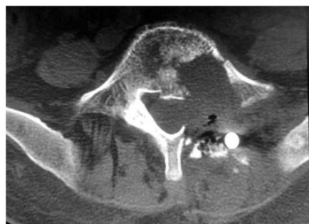
Figure 4. Postoperative computed tomography showed the extent of decompression of the L5 left nerve root canal.

back pain was alleviated and the L5 neuralgia promptly vanished. However, the L5 neuralgia reappeared on postoperative day 5. Despite administration of mannitol,