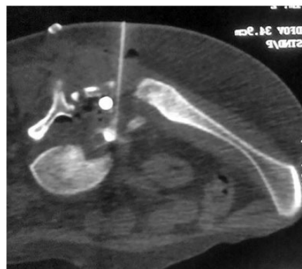
Figure 5. Percutaneous injection of epirubicin into the intervertebral foramina under computed tomography guidance for L5 dorsal root ganglion destruction. Iohexol was injected to verify accurate placement of the needle.

back pain was alleviated and the L5 neuralgia promptly vanished. However, the L5 neuralgia reappeared on postoperative day 5. Despite administration of mannitol,