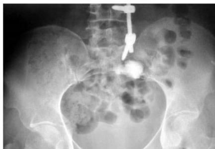
Figure 7. A plain radiograph showed the incorrect location of the osteoplasty; i.e., the sacrum was mistaken for the ilium.

with her symptom (Figure 6). After readmission, we performed percutaneous osteoplasty under C-arm X-ray guidance. During the operation, the lesion site was difficult to locate by X-ray because of the overlapping bone structures. The patient was still painful postoperatively, and plain radiography and CT showed an incorrect location of the osteoplasty; that is, the sacrum had been mistaken for the ilium despite the fact that the sacrum was also infiltrated with carcinoma (Figures 7, 8). We informed the patient of this occurrence and suggested re-osteoplasty for the iliac lesion under CT guidance. She declined this treatment and requested conservative therapy. We administered 4 mg of zoledronic acid (Zometa; Novartis Pharmaceuticals Corporation, Basel, Switzerland) and 4 mCi of strontium-89 chloride (Metastron; GE Healthcare,