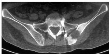
Figure 6. Computed tomography showed osteolytic destruction of the posterior superior iliac spine.