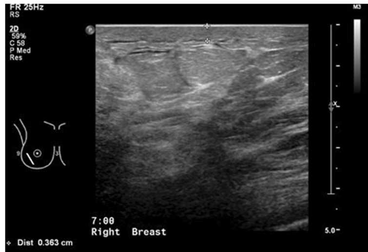
Figure 1 Right breast ultrasound showing skin thickening and underlying marked inflammatory changes with increased echogenicity.

There was no lymph node involvement and the margins were clear. The estrogen and progesterone receptors status were both negative. Her2 neu score was positive. Her post-operative recovery was uneventful and the patient did not require any further treatment.