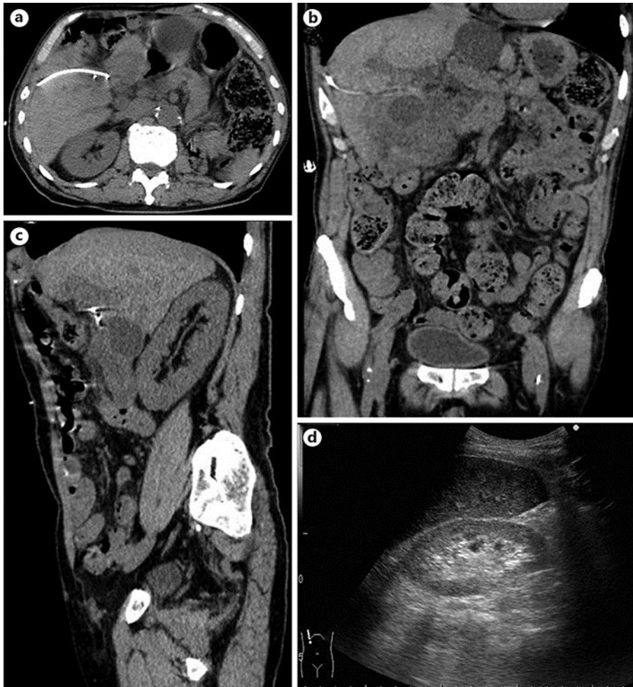
Fig. 3. CT performed 18 days after catheter insertion showed marked regression of the hepatic cyst (a, b) and relief of the ureteral obstruction (c). d Abdominal US showed relief of right hydronephrosis.