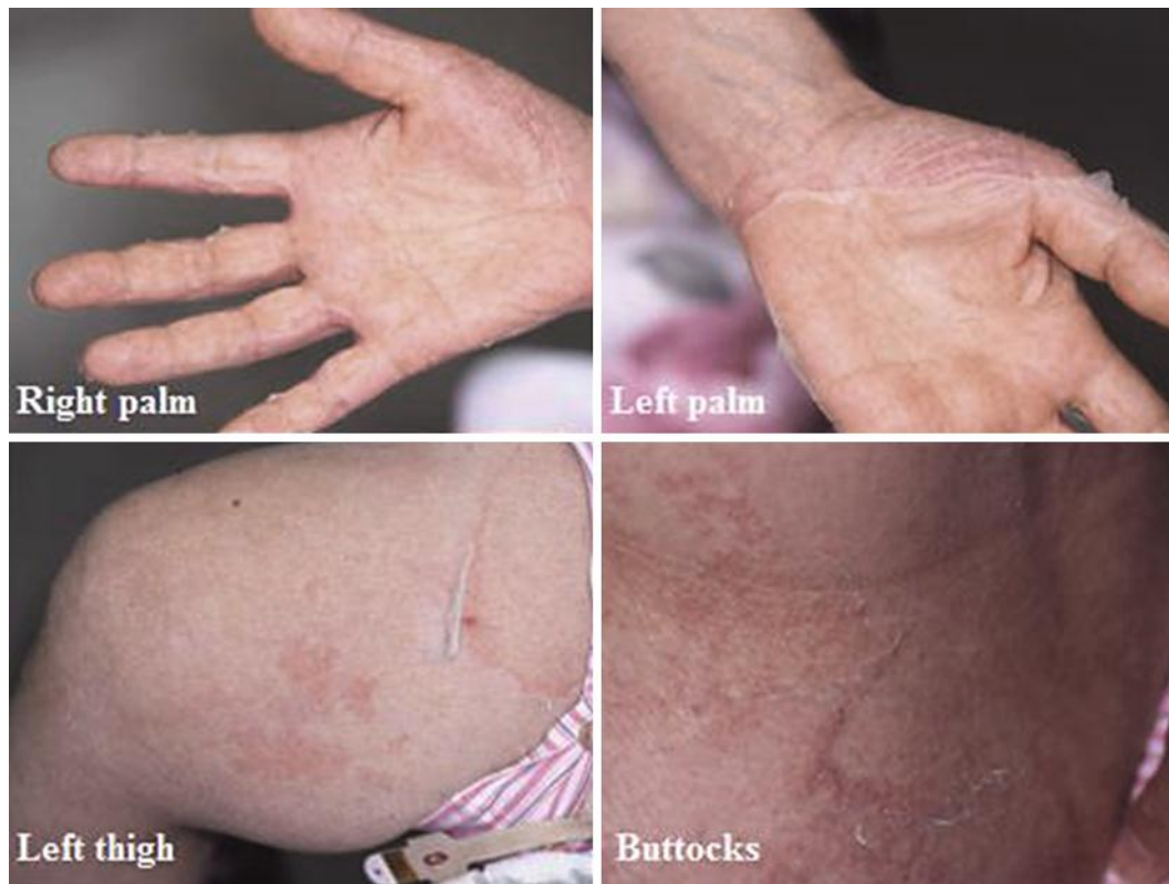
Fig. 1. Peeling of the skin was noted on both palms, thighs and buttocks. Erythematous color changes at the site of peeling were observed. Shedding of the skin was observed more prominently on the palms, forearms and intertriginous areas than on the torso.