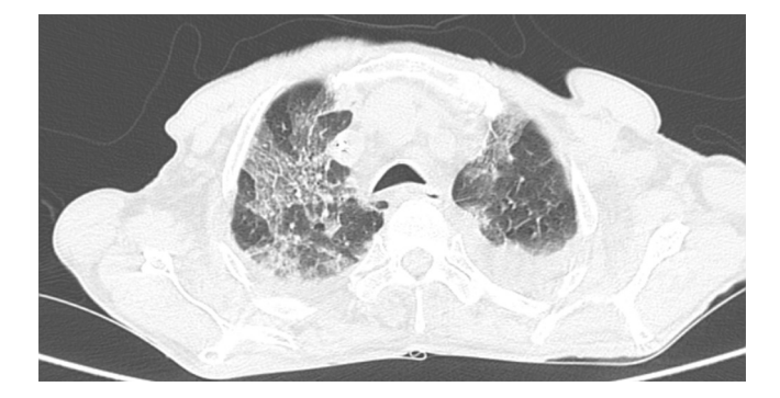
FIGURE 2 - Chest CT scan taken on the 5th PO day