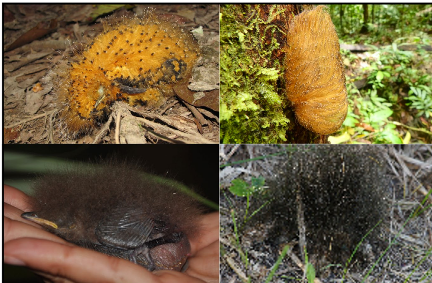
FIGURE 1 Images of nestlings from the Laniisominae clade. Two forms of mimicry are shown. Top—Batesian Mimicry in nestling of Laniocera hypopyrra (left). The nestling has many characteristics both morphological and behavioral that increase its similarity to the toxic caterpillar (Megalopygidae) (right). Masquerade Bottom—The nestling Schiffornis turdina (left) has elongated, dense juvenile downy feathers that resemble a fungus found in the area (right)